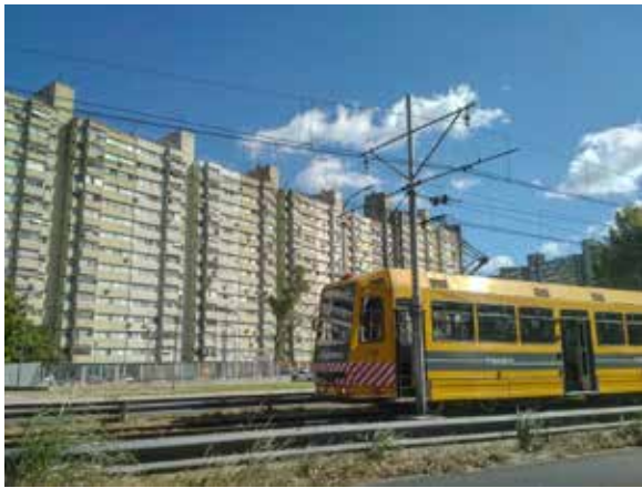
Perónism supplied a heady mix of public goods, including mass housing, jobs through import substitution, and ego national projects from architecture to airlines – until the money ran out.

Not only did Perónism advocate interventionism, protectionism, and high levels of state spending, but these policies ensured political support of the masses through subsidies and preferences. For example, to ensure his 1946 election victory, he persuaded the president to nationalise the Central Bank and extend Christmas bonuses. Such spendthrift redistribution, while politically expedient, has served repeatedly to destroy capital accumulation, while attempting to baulk the inevitable reality of internal budget constraints and the underpinnings of global competitiveness.