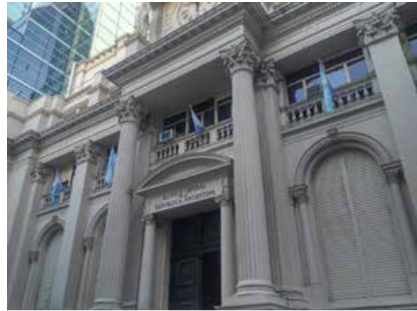
A history of hyperinflation and reckless fiscal management and galloping monetary supply, at the root of which is politics.

Attempts at reform have foundered on an all-too-easy reversion to populist politics and free spending.