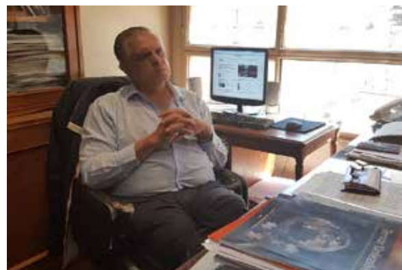
Ricardo López Murphy, former Economy Minister and Presidential Contender

This drew from an ideological cocktail of 'Keynesian policies and [the dependency theory of Raul] Prebisch,' says López Murphy, 'of the need for state interventionism in industry to offset the belief that while the cost of commodities fell the price of manufactured goods would rise.' The reality has since, however, proven completely inverse to this theory, though this structuralist argument has informed a generation of economists and political leaders in Argentina and farther afield, in part because there is a vested interest between politicians, unions and businesses which prefer a protectionist, if thus expensive local market. This is borne out by a comparison of Latin America's growth under ISI and that of the 'Asian Tigers' of Singapore, Taiwan, Hong Kong and South Korea with an export-led growth strategy during this period.