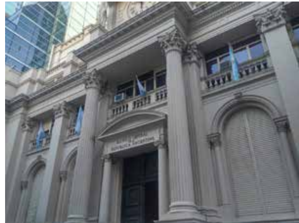
A history of hyperinflation and reckless fiscal management and galloping monetary supply, at the root of which is politics.

Attempts at reform have foundered on an all-too-easy reversion to populist politics and free spending.