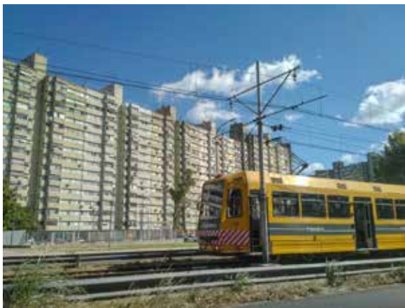
Perónism supplied a heady mix of public goods, including mass housing, jobs through import substitution, and ego national projects from architecture to airlines – until the money ran out.

Not only did Perónism advocate interventionism, protectionism, and high levels of state spending, but these policies ensured political support of the masses through subsidies and preferences. For example, to ensure his 1946 election victory, he persuaded the president to nationalise the Central Bank and extend Christmas bonuses. Such spendthrift redistribution, while politically expedient, has served repeatedly to destroy capital accumulation, while attempting to baulk the inevitable reality of internal budget constraints and the underpinnings of global competitiveness.