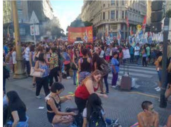
Public protest is a national sport in Argentina; taking responsibility is not.

between politics and labour unions. It is close to the Plaza de Mayo, where Perón was the target of an air attack during the 1955 attempted coup, killing over 300 people.