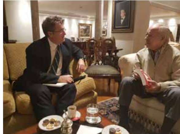
Carlos Menem, President of Argentina: 1989–99

Despite increasing physical infirmity, Menem is as clear today as he was then about the path that Argentina needed to follow. He sees no contradiction between Perónism and these reforms or, for that matter, democracy. 'It is not possible,' he states, 'to have development without democracy. We have had military rulers. They are good at giving orders, but not to govern. They have been failures, in Argentina and elsewhere, such as now in Venezuela, which should be a very rich country.'