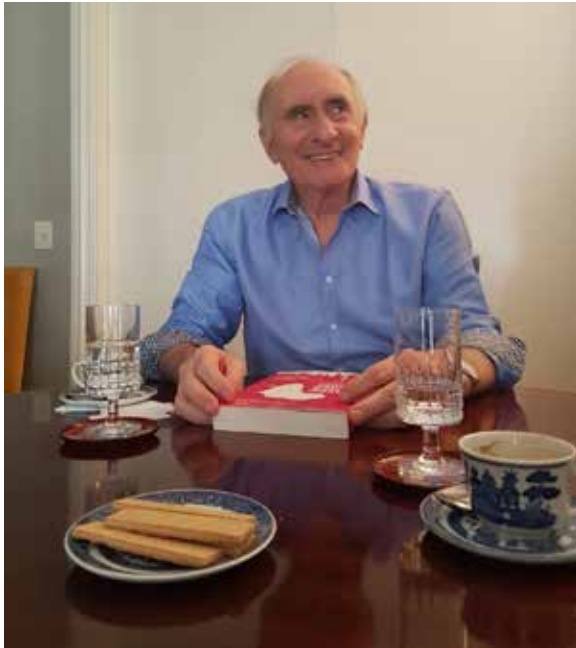
Fernando de la Rúa, President of Argentina 1999–2001

the ideological cover of ridding the country of 'neo-liberalism'.