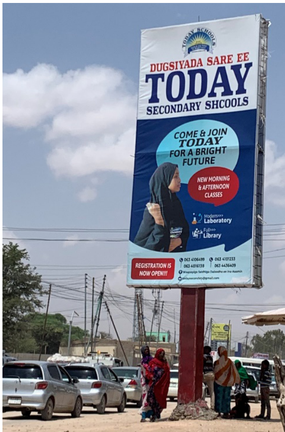
A billboard advertising a private school. Most education is run by private institutions that produce poor results with literacy at just 18 per cent.

is straining. Infrastructure is poor. The unemployment rate among those under 30, who comprise 70 per cent of the population, is 75 per cent. 1 The chewing of khat is a widespread social blight among more than half the adult population, an effective tax on productivity and foreign exchange, soaking up as much as US$700 million in annual imports. 2