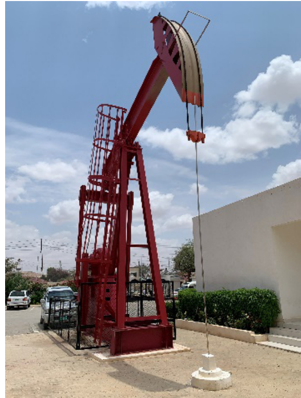
An oil derrick on the ground of the ministry of energy and minerals in Hargeisa. These may soon become a regular feature of the desert landscape.

The optimism over the possibility of oil in Somaliland derives from the fact that it shares the same geology as the oil fields on the Arabian Peninsula. 'The oil is there, it is just a matter of when we get it,' says Egal.