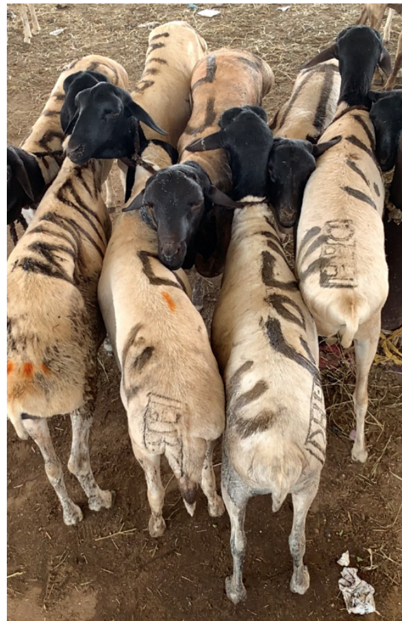
Blackhead Persian sheep await their fate at the Hargeisa livestock market. The export of these sheep to Saudi Arabia is the country's major earner of foreign exchange.

Although Somaliland struggles to export its livestock because of its unrecognised status, this unique sheep is an exception. During the annual Muslim pilgrimage to Saudi Arabia, more than a million sheep and goats are exported for slaughter in keeping with religious tradition.