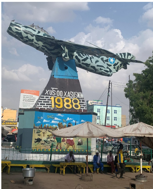
A Mig fighter on a plinth in downtown Hargeisa serves as a reminder of the bloody civil war. But these days it is the place where the growing army of unemployed youth hang out to drink Somali tea.

The restive east notwithstanding, a great deal has been achieved by the hitherto unrecognised Republic of Somaliland since its re-proclamation of independence in 1991.