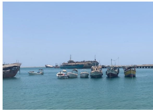
Part of the small fishing fleet at anchor in Berbera. The vessels, which are mostly between five and 12 meters long, are too small to be commercially successful.

a flock.' 13 This is, in fact, the case at present, as fishing is conducted on a small scale and the sale of fish is limited to the coastal area due to the lack of a reliable cold-chain for the transport of the fish to the interior. It is notable that the capital city of Hargeisa with its large population, has no fish market despite its relatively close proximity to the coastline. Fish ought to be a readily available cheaper protein option throughout Somaliland and it ought to have an export market given the short distance to big fish-consuming markets in the Mediterranean which are readily accessible via the Red Sea and the Suez Canal.